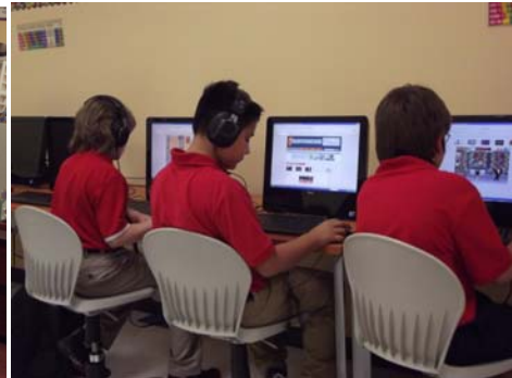
Video Games/Computers Club